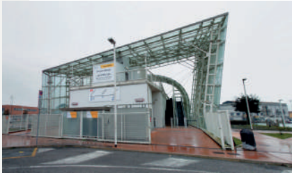
People Mover - Tronchetto

Take the People Mover monorail and get off at the “Piazzale Roma” stop, the last stop on the line (Tronchetto - Marittima - Piazzale Roma).