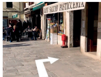
Sotoportego Ca’ Pozzo on your right, next to the bakery