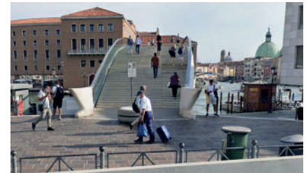
Ponte della Costituzione (Calatrava)

Cross the bridge and continue walking straight ahead until you see the Venezia Santa Lucia train station on your left. From here you can take the waterbus (vaporetto) or continue on foot.