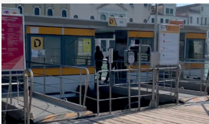
Railway stn. D

Once you get off at the “Guglie” stop, continue along the canal towards the “Ponte delle Guglie” and as soon as you pass the kiosk on your right, turn left and go through the “Sotoportego Ca' Pozzo” underpass that is next to a bakery. At the end of the underpass you will find the Ca' Pozzo inn on your left.