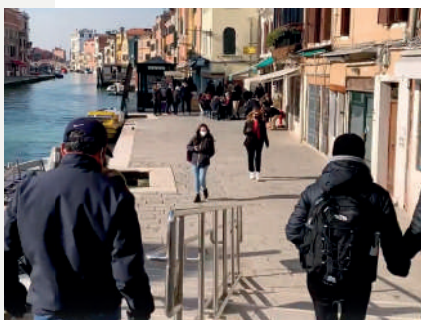
Turn left after crossing “Ponte delle Guglie” Bridge