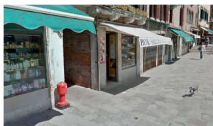
Sotoportego Ca' Pozzo