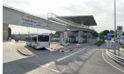
People Mover - Marittima